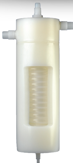
XC inline heat exchangers (cutaway for illustrative purposes).

Process Technology's rugged XC inline chemical heat exchangers are ideal for one-pass cooling of chemicals dumping to waste stream. This product is also appropriate for heating applications. The system innovatively eliminates high costs associated with water aspiration. Utilizing polypropylene or PVDF housing and fluoropolymer tubing, XC is configured for your application with custom sizes and configurations available.